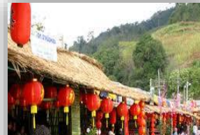
Doi Maesalong (+150 ฿)