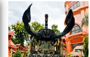
Doi wao Temple