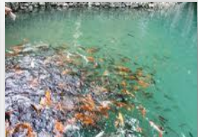
Fish & Monkey cave