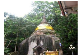
Wat pha ngao